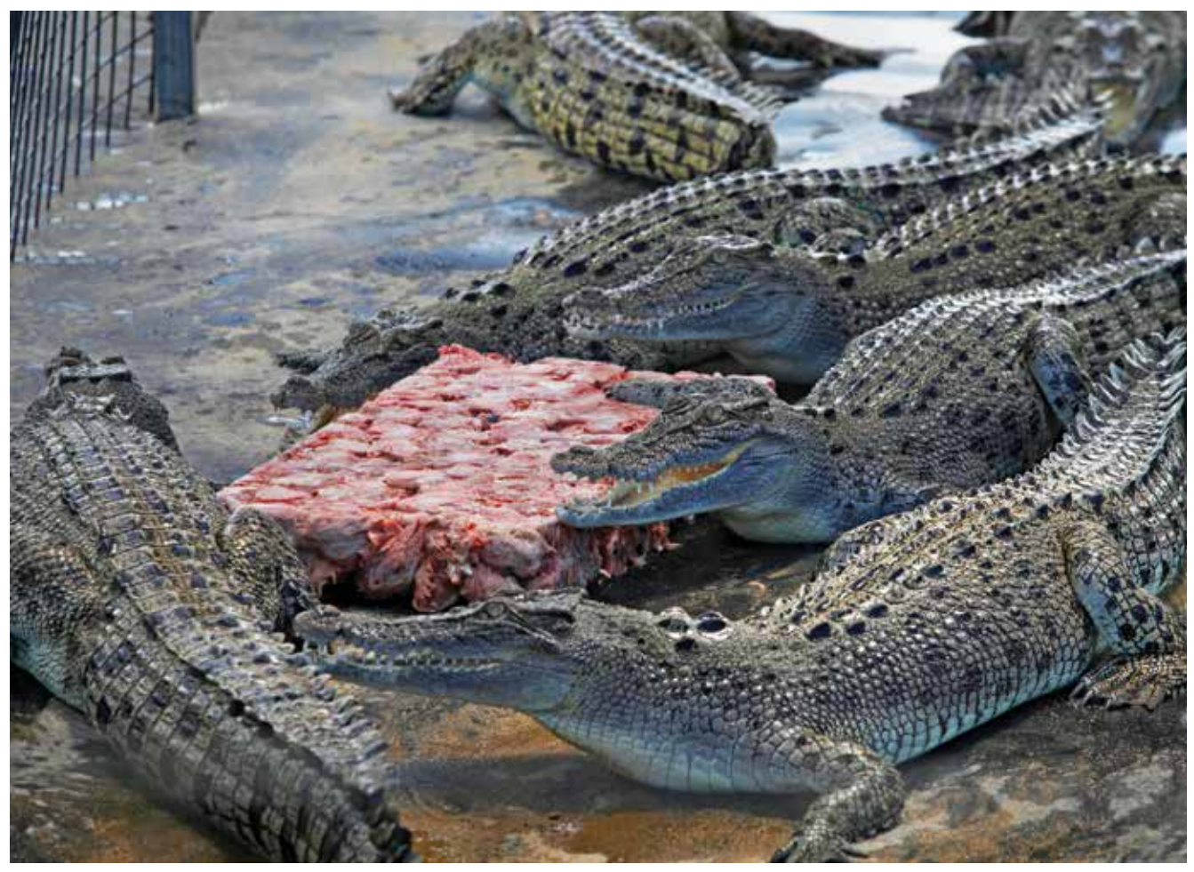
Image: Feeding of sub-adult crocodiles in a communal farm enclosure.

the most recent studies are 15 to 16 years old. It is therefore totally inadequate to uphold the minimum standards for best practice farming for crocodile welfare in 2021. The Code acknowledges its own limitations stating it is '... based on current knowledge about crocodile welfare issues and what is currently 'thought to be best practice' in humane handling techniques<sup>27</sup>. It adopts a "precautionary approach in the light of incomplete knowledge.' The Code states gaps in knowledge of physiology, behaviour, pain thresholds of crocodiles and the need for further research to improve humane treatment (i.e. to minimise pain and suffering). It also makes no reference to quality of life for the farmed animals. The Code states that it will need to be modified as new information comes to light: "..research into all aspects of captive husbandry is needed and is progressing rapidly around the world. This may alter current husbandry practices and policy"<sup>27</sup>. That this was written 12 years ago is concerning.