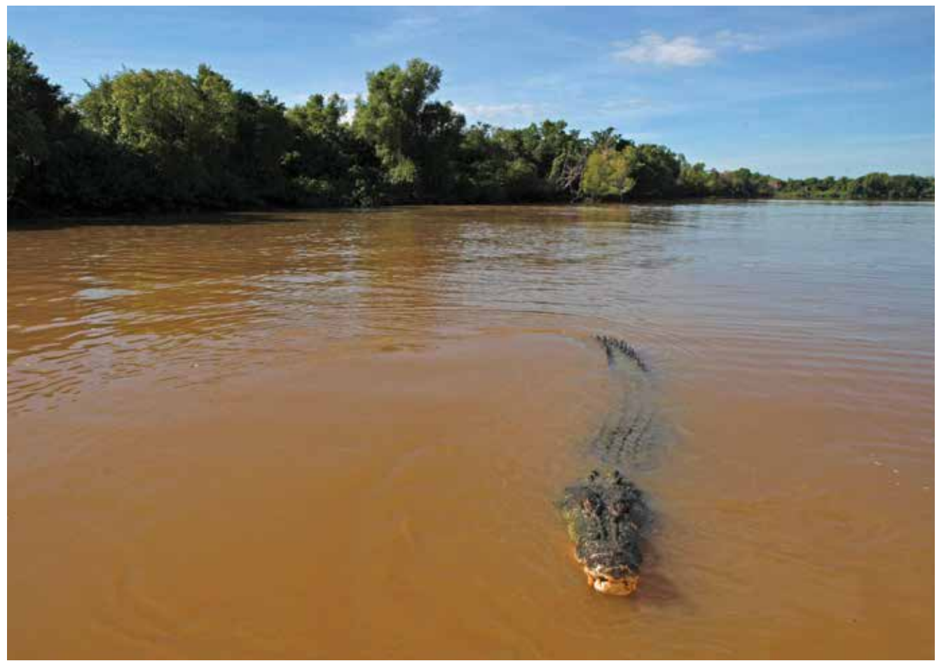
Image: A wild crocodile swims in the Adelaide River, Northern Territory.

Crocodiles are cold-blooded, relying on the external environment to regulate their body temperature. This involves moving in and out of water, basking on land, shade seeking and mouth gaping. Their behaviour is subtle - although they spend large amounts of time motionless, they are often alert watching their environment. They have highly developed vision, hearing and sense of smell allowing them to probe their surroundings<sup>18</sup>. Crocodiles have dominance hierarchies and males are territorial. Females use elevated, shallow sites for their nests which they defend. They are opportunistic predators that ambush their prey then drown it. Prey includes fish, goannas, birds, cattle, buffalo and wild boar. Saltwater crocodiles are one of the most aggressive species of crocodilian with the least tolerance of conspecifics (i.e. being in close proximity to other crocodiles)<sup>19</sup>.