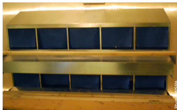
■ Multiple nest boxes with privacy curtains.

The proper construction and availability of suitable nest sites will help reduce the occurrence of floor eggs (Appleby, 1984; Appleby, Hogarth & Hughes, 1988; Duncan & Kite, 1989). Providing more nest choices and suitable nesting material, like peat or artificial turf, will encourage hens to lay eggs in the nest area (Rodenburg et al., 2005). Ensuring that nest boxes are secluded and the floor area is well lit will also discourage floor laying.