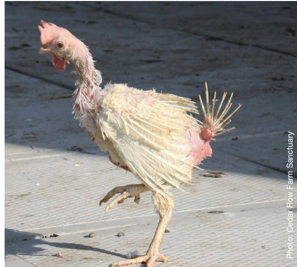
■ This spent hen with severe feather loss was kept in a battery cage system.

Injurious pecking occurs in all hen housing systems. Most modern laying hen breeds will result in flocks including a few birds that have a strong tendency to feather peck regardless of the environment. While cages minimize the number of hens these 'primary peckers' can directly access, hens that are not confined are at least able to escape. Also, many aspects of the cage environment can exacerbate feather pecking. For example, overcrowding, barren environments, lack of loose litter, lack of foraging opportunity (Dixon, 2008), lack of perches during early rearing, and the genetic strain of the hen (selected for production traits over welfare) can all contribute to injurious pecking. Feather pecking has also been associated with fearfulness, and studies have found caged hens to be more fearful than hens in cage-free systems (Rodenberg et al., 2005).