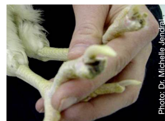
■ Caged hen with toe pad hyperkeratosis.