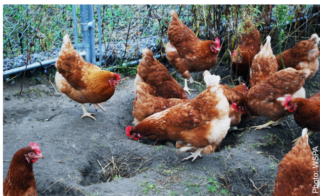
■ Hens dustbathing in a free-range system.