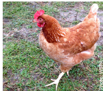
■ An ISA Brown hen.