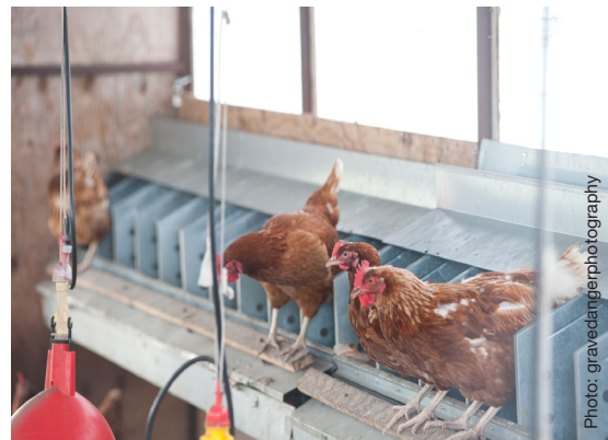
■ Multiple nest boxes in a cage-free system.

In cage-free systems, hens typically have multiple nest boxes to choose from and studies show they will inspect many potential nest sites before making a choice (Meijsser & Hughes, 1989). The Canadian Recommended Code of Practice suggests that free-run egg farms provide 20 nests for every 100 hens, and the British Columbia Society for the Prevention of Cruelty to Animals (BC SPCA) requires farmers to adhere to this ratio in order to receive their certification. The cage-free guidelines adopted by UEP (2010), recommend 9 ft 2 (.84 m 2 ) of community nest space per 100 hens.