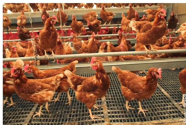
■ The perches, feeders and drinkers are over the slatted floor at Rabbit River Farms in Richmond, B.C.

Collecting floor eggs soon after they are laid will discourage other hens from laying their eggs in the same location, and placing those eggs in the nest site will help hens find the appropriate laying area. Hens can also be encouraged to defecate on slats or perforated platforms so that manure can be removed from barns by conveyor belt and stored or composted immediately. Some farmers have effectively accomplished this by positioning the feeders, drinkers and perching areas above slatted floors (S. Easterbrook, personal communication, June 20, 2012).