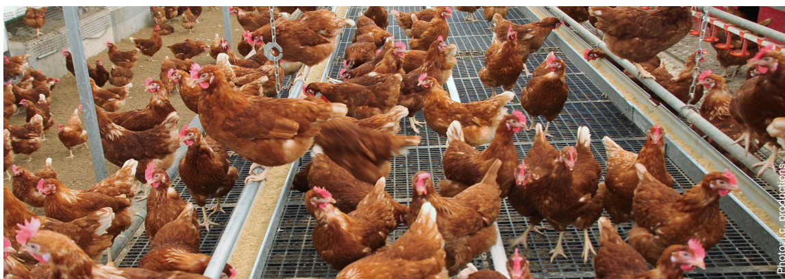
■ Manure falls through the slatted floor and onto a conveyor belt in this cage-free housing system.

Frequent manure removal and proper manure and litter management are keys to improving air quality in cage-free systems. New aviary systems have been designed to allow frequent manure removal: feeders, drinkers and perches are placed over slatted floors to encourage hens to defecate over a manure conveyer belt, which can capture approximately 90 percent of fecal matter (Bos, Groot Koerkamp & Groenestein, 2003) (S. Easterbrook, personal communication, June 20, 2012). This minimizes the time manure is exposed to the air, decreasing ammonia emissions and improving air quality.