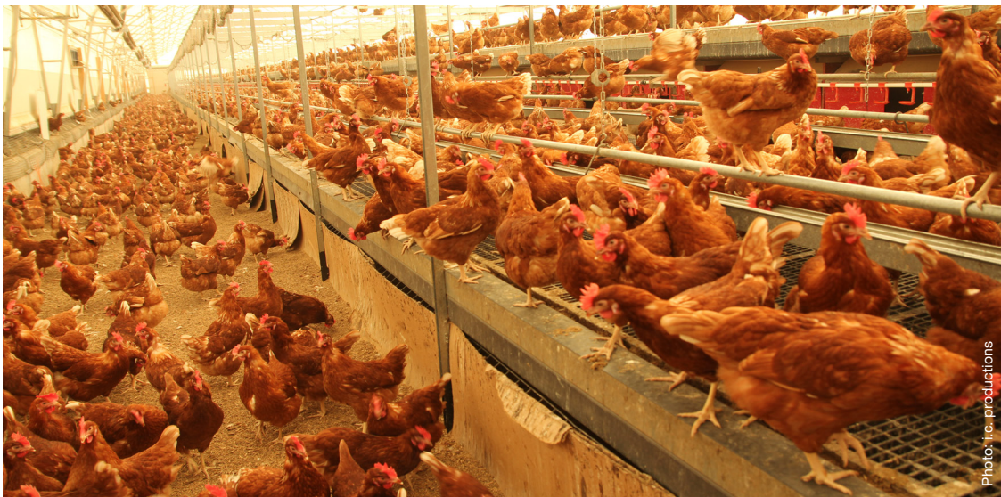
■ Hens in an aviary - a type of cage-free system that provides multi-level perches.

Cage-free systems, on the other hand, generally provide each hen with more space and give them more opportunity to space themselves out in a more natural way. If the industry's voluntary guidelines are followed, each adult brown hen must have at least 295 in 2 (1,900 cm 2 ) of floor space in Canada (CARC, 2003) or 173 in 2 (1,116 cm 2 ) in the U.S. (UEP, 2010). However, an increasing number of cage-free farms in North America are certified by independent animal welfare assurance schemes, which have larger space requirements than what is stipulated in the industry's guidelines. These mandatory requirements are verified by independent third party inspectors. Hens kept in cage-free systems have more space for comfort behaviour such as wing flapping, stretching, body shaking and tail wagging (Rodenburg et al., 2005). They also spend more time walking than those kept in cages (Tanaka & Hurnik, 1992). Since cage-free hens are able to exercise more they tend to have stronger wing and keel bones than