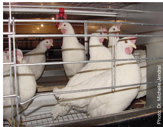
■ Hens outside nest box in furnished cage.

Battery cages do not provide hens with nests, and there is typically only one nest area per furnished cage. 5 Because the largest furnished cage systems in North America are designed to house up to 60 (possibly up to 115) (LayWel, 2006) birds and nesting has become a gregarious behaviour pattern that hens like to perform together, they may have to compete to use the nest area. Some will choose to stay in the nest area when not laying eggs, as it is the only private area where a hen can seek refuge from the other birds. Since hens prefer a private nest area, this prevents other hens from laying their eggs in the occupied area.