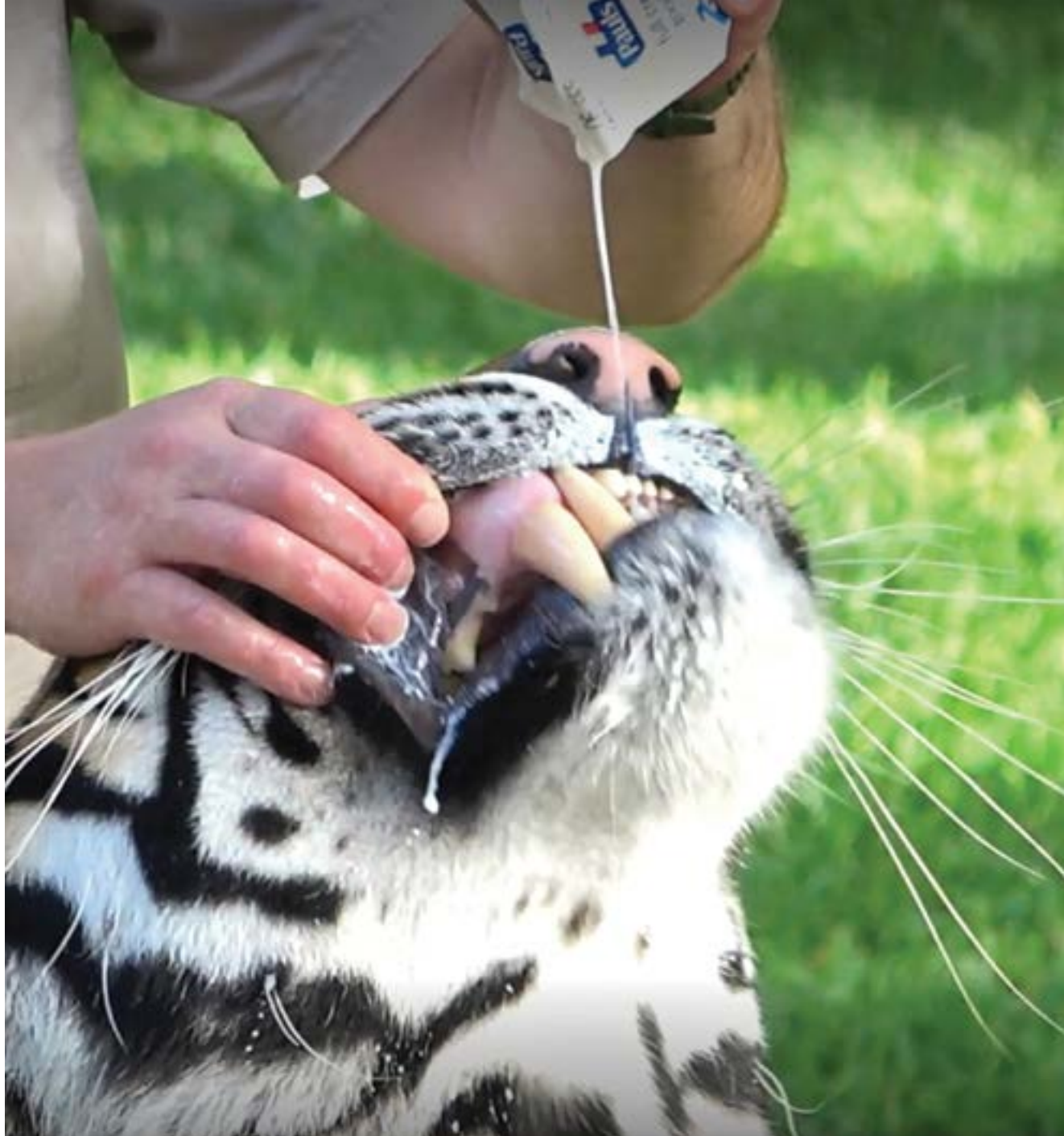
Image: A tiger is fed milk during the Tiger Presentation at Dreamworld.