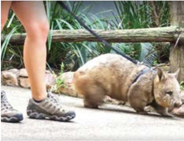
Image: A wombat being walked on a leash at Australia Zoo.

On one visit, there were even wombats being walked around the venues on a leash, an activity that blurs the line between a wild animal and domesticated pet. The Australia Zoo official visitor brochure also aims to create the impression that the animals get enjoyment from the interactions with claims such as meerkats "...just love meeting our visitors"; the tortoises "absolutely love a pat"; and the echidna may "sit on your lap" 39 .