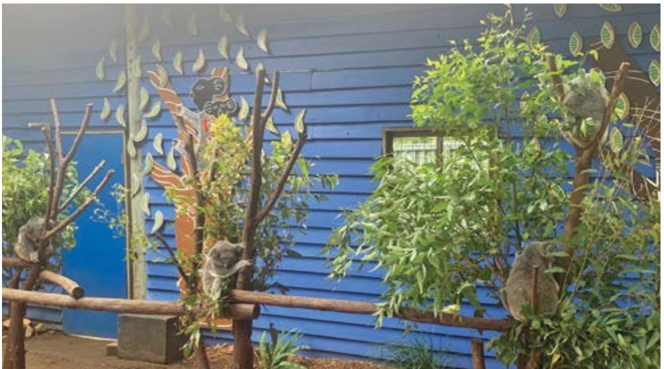
Image: Koala enclosure at Dreamworld near the photo booth.

away from visitors and presented his back. Although the animal clearly showed avoidance behaviour due to not wanting to be involved in the encounters, he continued to be used with the keeper noting that the behaviour was 'something it typically does'.