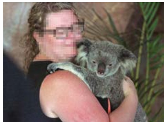
Image: A visitor at Australia Zoo holds a koala for a photo.

On any one day at Australia Zoo there are 20 different wildlife attractions on offer, including two shows. Their 18 close encounters with wildlife and shows are promoted through extensive advertising throughout the zoo itself, messages in shows and talks, the website and the visitor brochure. From the moment visitors drive through the gates of the zoo, and throughout their zoo visit, they are bombarded by images of close encounters and selfies with wild animals. These images involve Irwin family members, zoo staff and visitors, and advertisements enticing visitors to take part in photo opportunities and close encounters. Visitors are encouraged to get photos with animals through paid photos in the 'Wildlife Photo Studio', paid close encounters, the Wandering Wildlife Team with "photographers and keepers" holding koalas, lizards and snakes, and walk-through exhibits where visitors can pat and take photos with koalas and kangaroos.