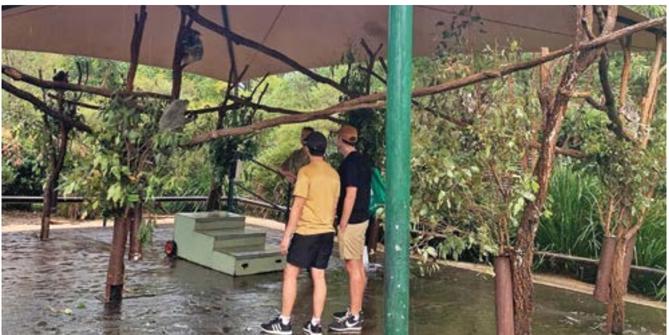
Image: Open koala zone for close encounters.

During a visit by World Animal Protection in May, a visitor was observed ascending the staircase to engage with a koala. The animal exhibited clear avoidance behaviour in response, moving further up the fake tree and at one point seeming to swat away the visitor's hand as she touched her.