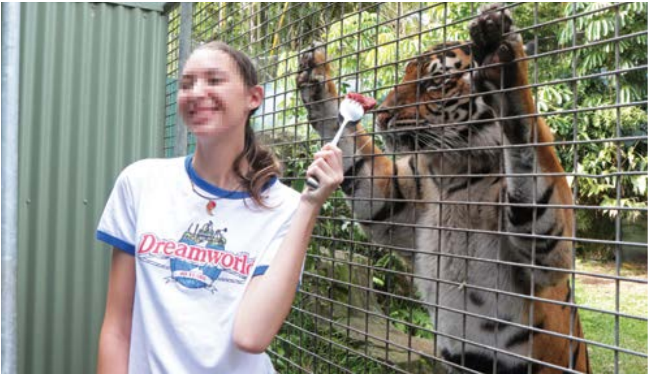
Image: A booked close encounter at Dreamworld in Queensland.

take photos next to the koalas. Photo opportunities are also available for a range of other native and exotic species, including marine mammals and shows with dolphins or seals and sea lions performing.