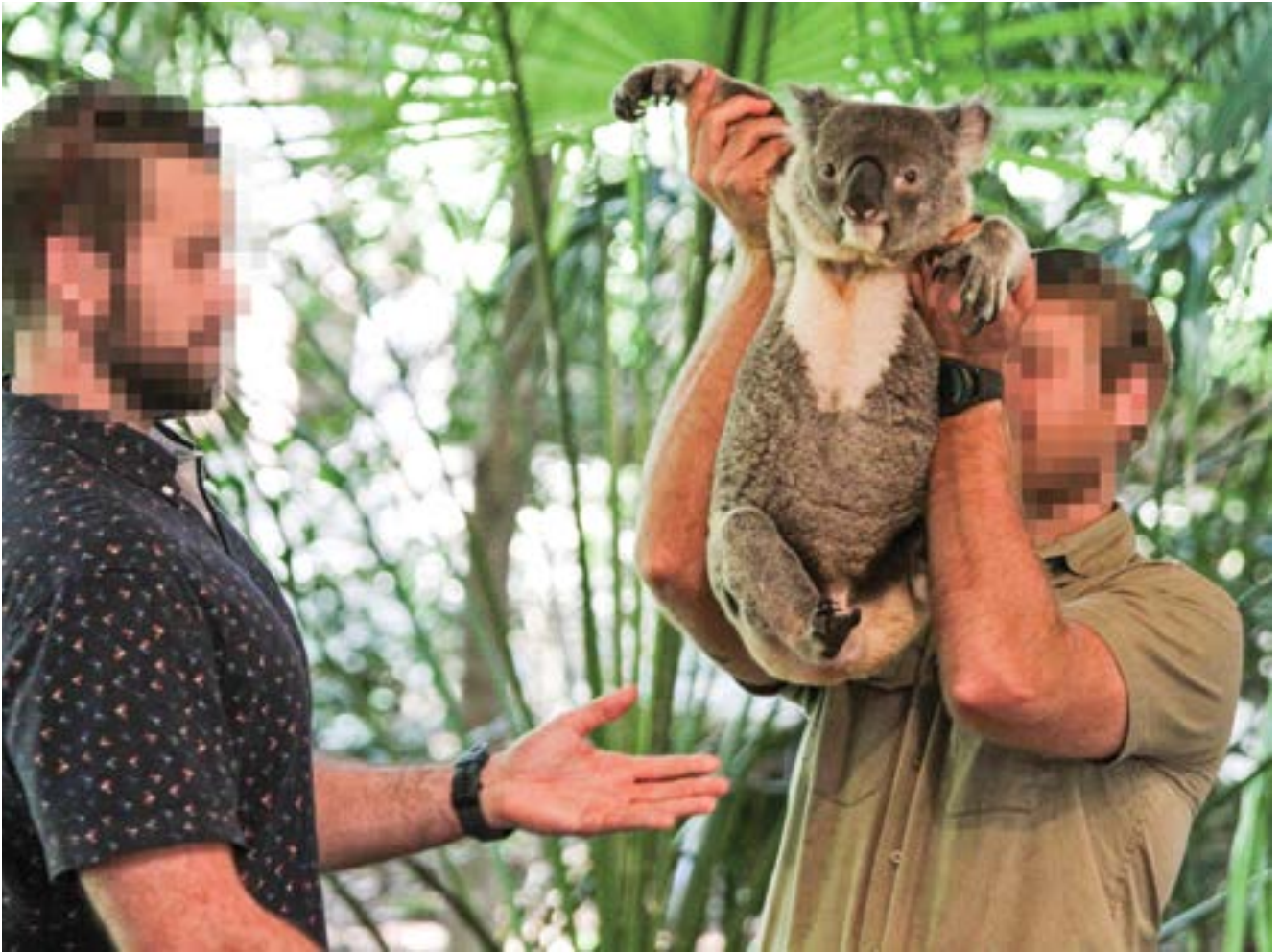
Image: A koala being handed to a visitor for a photo at a wildlife venue in Queensland, Australia.

In addition to welfare concerns for captive koalas, research has revealed that Queensland's wild koala population has plummeted by an estimated 50% since 2001 and the NSW koala population up to 62% over the same period. In February 2022 koalas were listed as an endangered species in Queensland, New South Wales and the Australian Capital Territory 36 . While venues offering the experience of holding koalas like to claim that interactions foster respect and concern for endangered species, they are clearly failing to do so, undermining a key rationale for the practice.