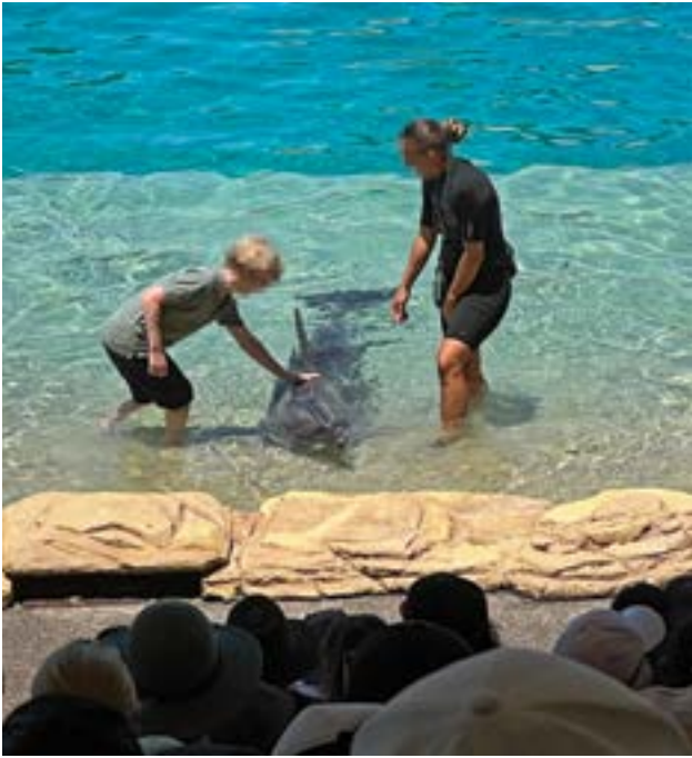
Image: Direct contact with a dolphin during the Affinity Dolphin Show.