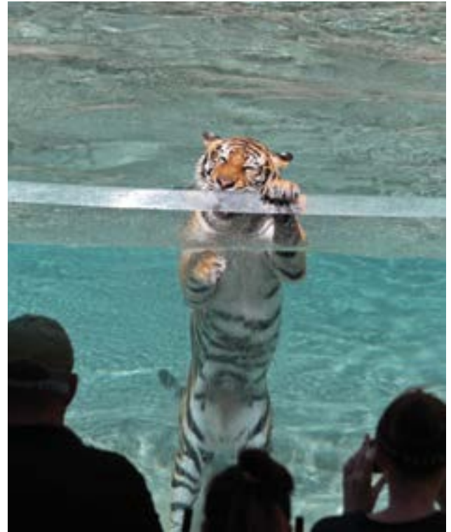
Image: A tiger in the pool in front of a crowd at the Tiger Presentation at Dreamworld.

During a visit by World Animal Protection, a keeper talk involved a koala being made available for patting by the crowd. Evidence that the koalas were not willing participants was obvious. One koala did not want to let go of the trunk he was on when the keeper attempted to take him for patting during a keeper talk. The keeper persisted in peeling his claws off the trunk, and when held, the koala turned