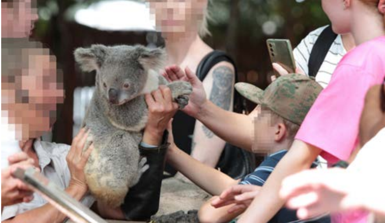
Image: Koala encounter at Dreamworld.