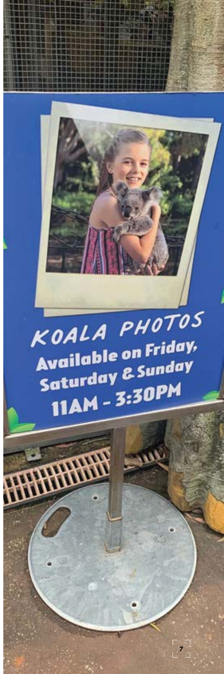
Image: A sign for koala photos at a wildlife entertainment venue in Queensland.

The Zoo and Aquarium Association of Australasia (ZAA) accredits zoos and aquariums across Australia, New Zealand, Papua New Guinea and Singapore. ZAA has guidelines for direct animal encounters, setting out expectations for all accredited venues. While ZAA does not oppose interactions per se, they do set criteria. An important one is that “If at any time during the interaction, a trained staff member sees that an animal’s behaviour indicates it does not want to participate, the animal must be taken out of the interaction” 18 . Regarding animal-visitor interactions, they “must foster respect for the species by presenting the individual in a respectful context as well as supporting the animal’s welfare” and “should not compel an animal to perform unnatural behaviours” 19 .