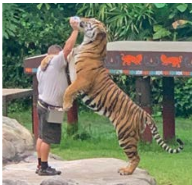
Image: A tiger drinks milk during the Tiger Presentation at Dreamworld.

perform, but they clearly had no choice other than to go through a highly choreographed show in which they engaged in behaviours that required training. As to reflecting natural behaviours, in the wild tigers are most active at dawn, dusk or during the night, not during the day when these performances occurred. It is also questionable how a tiger drinking milk from a bottle held by a human trainer can be said to reflect natural behaviours. The tigers displayed tricks for milk treats as a reward for jumping from one platform to another, climbing a tall post, standing on hind legs, being hand-fed milk, swimming and diving, and opening their mouths for health checks.