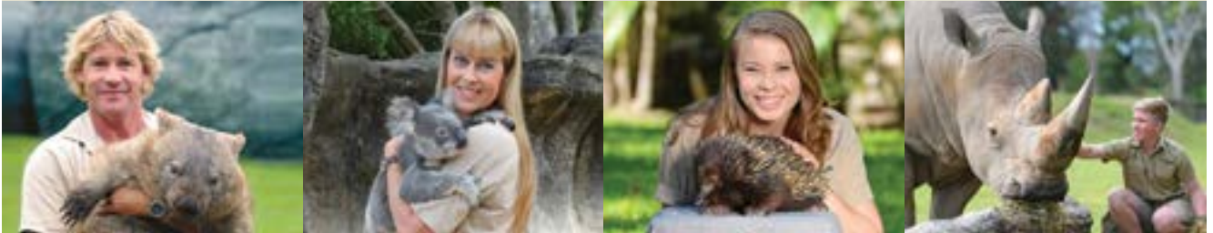
Image: A section from the Australia Zoo website.

Visit us at Australia Zoo to see over 1,200 animals including those found in our African Savannah, South-East Asia exhibit and Bindi's Island – as well as the original part of the zoo with all your Aussie favourites!