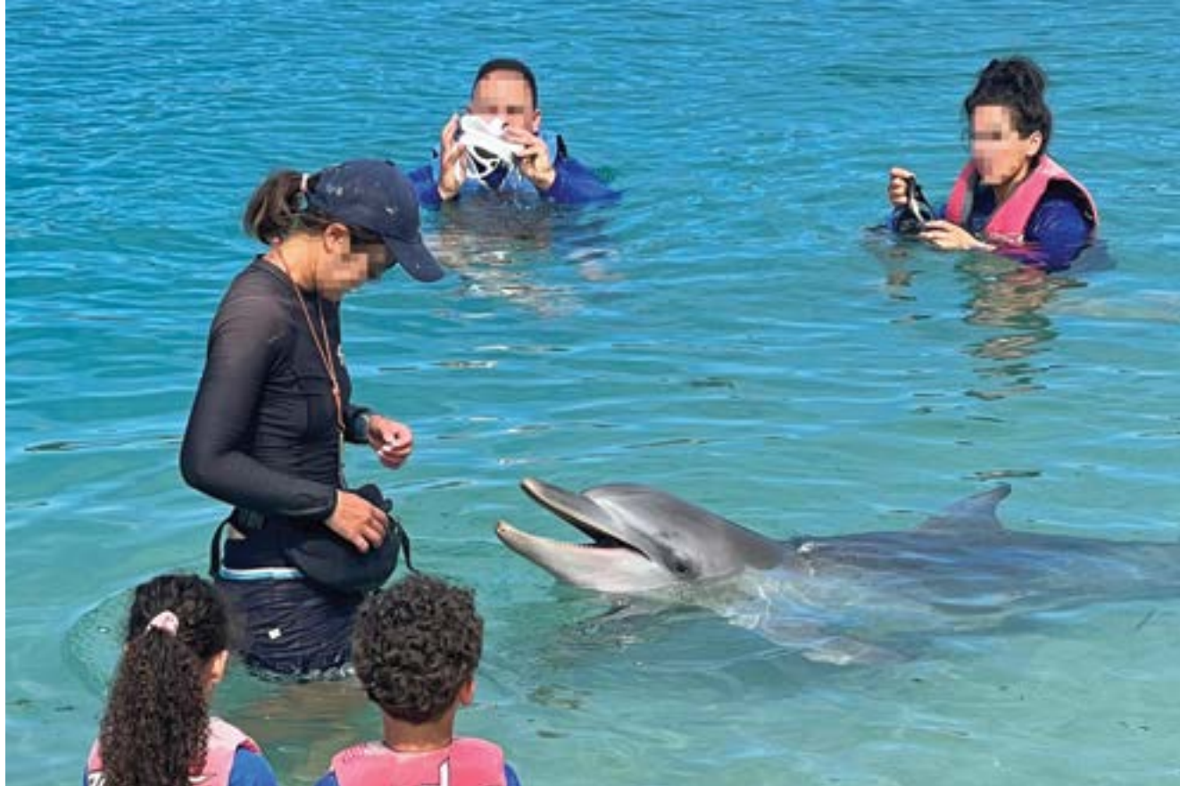
Image: A booked dolphin encounter at Sea World.