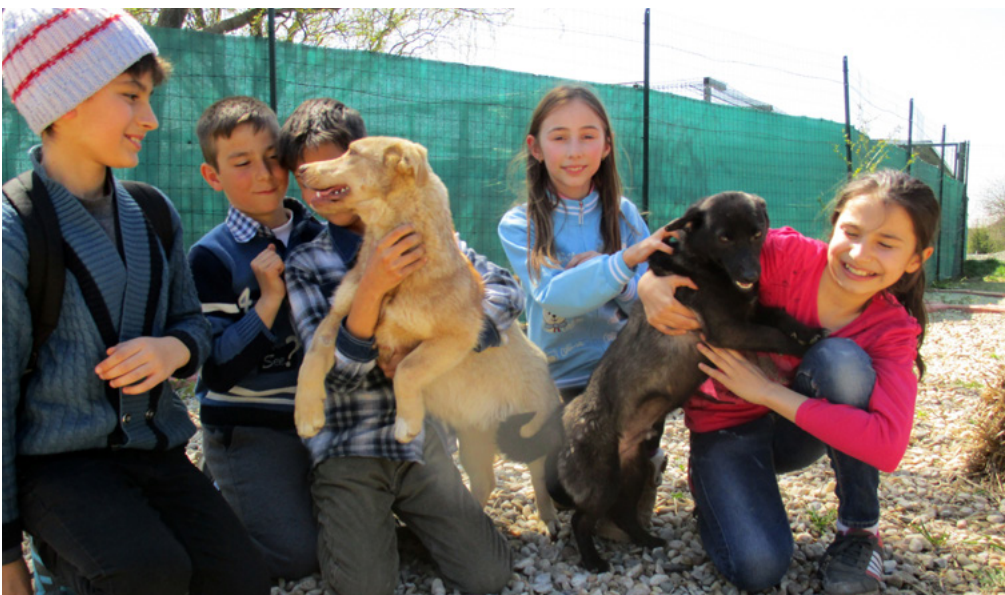
Left: Education: World Animal Protection supports an educational programme in Romania to encourage responsible pet ownership.

Most people interviewed in our survey (93%) 6 would like to see the government implement a local humane dog population management programme. The vast majority said they would be willing to take roaming dogs to get vaccinated and sterilised if the service was available in their communities.