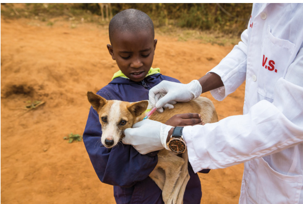
Left: In August 2018 World Animal Protection was in Makueni County, Kenya to oversee a small rabies vaccination drive being carried out in the area.

Moreover, the project highlighted the importance of collaboration between broader One Health stakeholders, which is key for humane rabies elimination and prevention of reoccurrence. Rabies elimination is possible with thorough planning, well-coordinated, structured implementation and adequate resources.