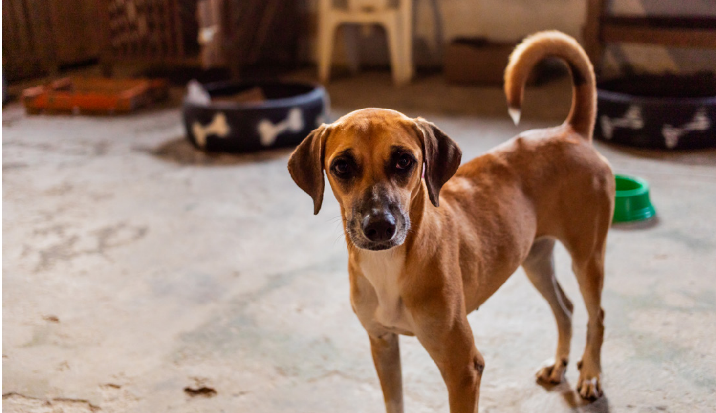
Above: Be part of it: Help eliminate human rabies by 2030.