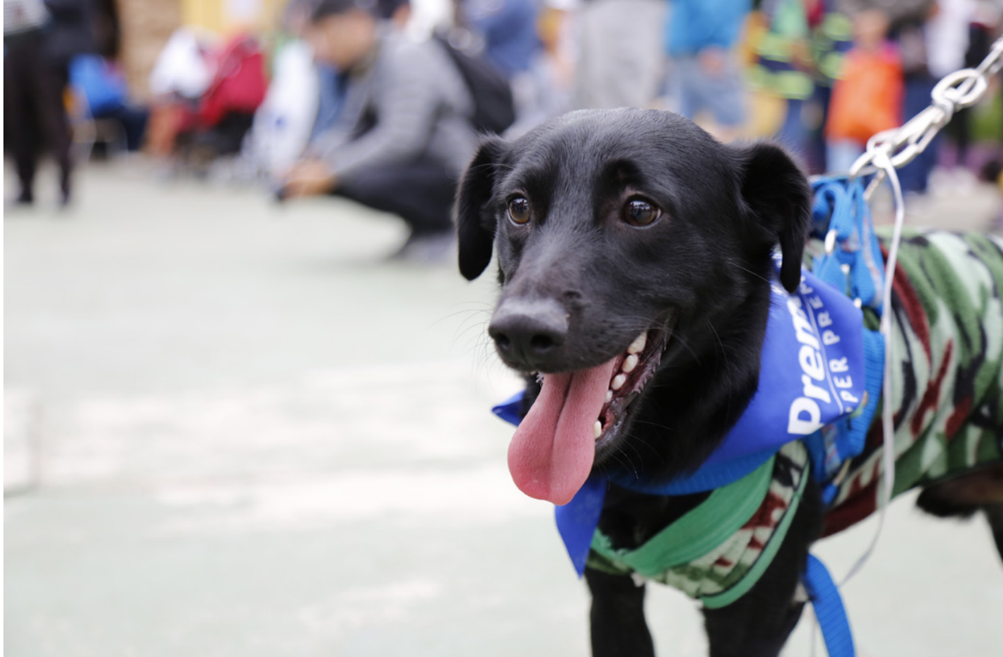
Above: On 28th September 2019, World Animal Protection carried out vaccinations for 200 pet dogs in Sao Paulo, Brazil, as part of World Rabies Day. The vaccination drive took place at a public school called Maria Quitéria in a suburban neighbourhood of the city. The drive also aimed to raise awareness of rabies, behaviour of dogs, and responsible pet ownership.

abandonment – which is problematic, especially if the dog is unvaccinated. Sterilising males also reduces roaming behaviour (except if roaming behaviour is learned), which automatically cuts the number of potential dog bite encounters. 23 Sterilising females may be justified if the biting behaviour from that female or a specific group of females comes from protecting puppies. We recognise that not all biting dogs will be rabid dogs, but that dog bites in general are a major concern for rabies/public health programmes.