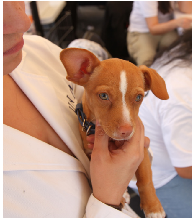
Right: World Animal Protection participated in a drill in Mexico City and used the opportunity to promote a public service announcement to include pets in the families emergency plan.

These developments, along with a growing appreciation of the efficacy of the One Health concept – a collaborative approach that encourages multiple sectors to work together to achieve better public and animal health outcomes – indicate that the time is right for another concerted push to eliminate rabies.