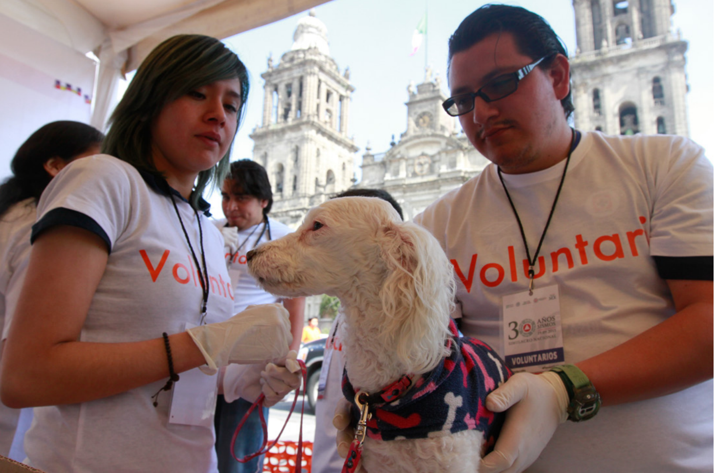
Above: In 1985 Mexico City suffered a devastating earthquake, which killed thousands of people. In 2015 the city marked the 30th anniversary with a drill. World Animal Protection participated in the drill and used the opportunity to promote a public service announcement to include pets in the families emergency plan.