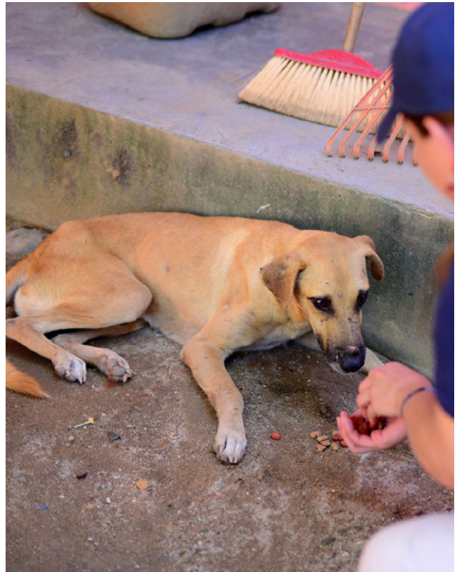
Above: A dog in Guerrero, Mexico.

The researchers further estimated that if current levels of expenditure for mass dog vaccination remain stable between 2017 and 2030 (US$ 2.457 billion), the financing gap over 13 years was just US$3.9 billion. If we compare this figure to the WHO/FAO/OIE estimate of